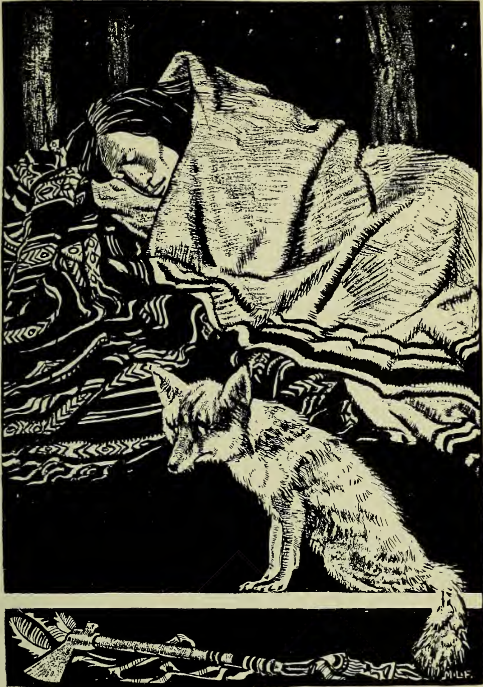
THEN THE YOUNG MAN LAY DOWN TO SLEEP AND FOX STOOD GUARD BESIDE HIM